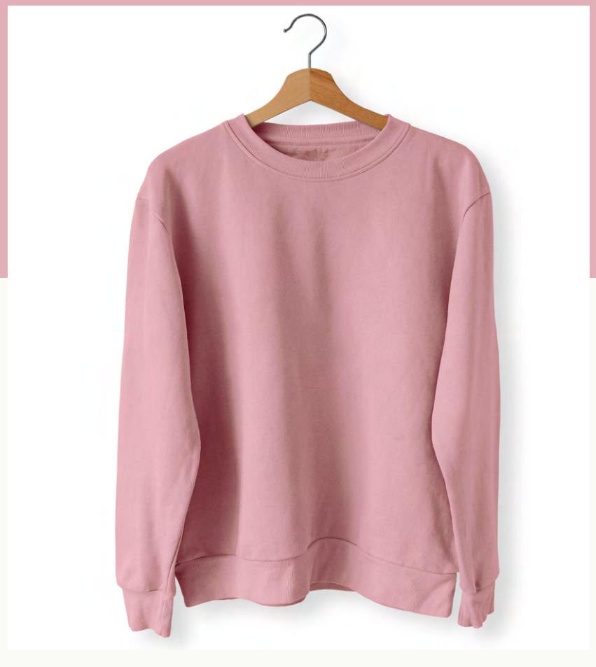
Customisations Garment Printing Embroidery